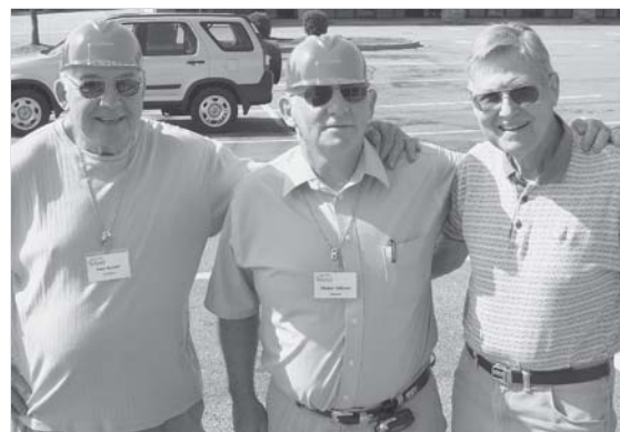
Hospice donors helping at the Hospice House groundbreaking