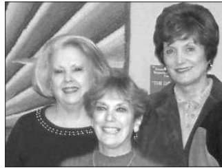
Good Samaritan volunteers

Bear Creek Bible Church Beulah Baptist Church Columbus United Methodist Church Coopers Gap Baptist Church Emmanuel Baptist Church Episcopal Church of the Holy Cross First Baptist Church of Gowensville First Baptist Church of Landrum First Baptist Church of Tryon Garrison Chapel Baptist Church Green Creek First Baptist Church Green Creek Missionary Baptist Church Jacksons Grove United Methodist Church Landrum United Methodist Church Landrum Springs Baptist Church Moore's Grove Baptist Church New Freedom Baptist Church Oak Grove Baptist Church Pacolet Baptist Church Pacolet Hills Baptist Church Pea Ridge Baptist Church Peniel Baptist Church Saluda Presbyterian Church Sandy Plains ARP Church Sandy Springs Baptist Church St. John the Baptist Catholic Church Tryon Presbyterian Church Tryon Seventh Day Adventist Church Wheat Creek Baptist Church